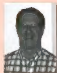
Category B Al Wall Toronto, ON